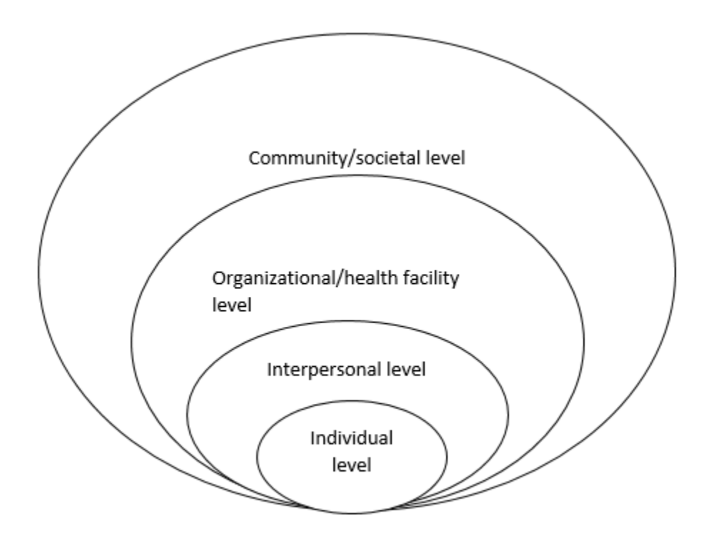
Figure 2: The SEM used to understand the facilitators and barriers of fathers involvement in the care of preterms admitted in the NU at KNRH.

involvement in the care of preterms admitted in NU (24, 25). The SEM in this current study was used to explore facilitators and barriers of fathers' involvement in the care of their preterms admitted in NU at individual, interpersonal, healthcare, community and broader societal levels at KNRH.